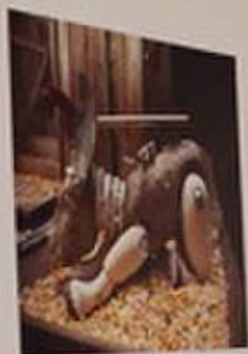
Das ist ein Maultier